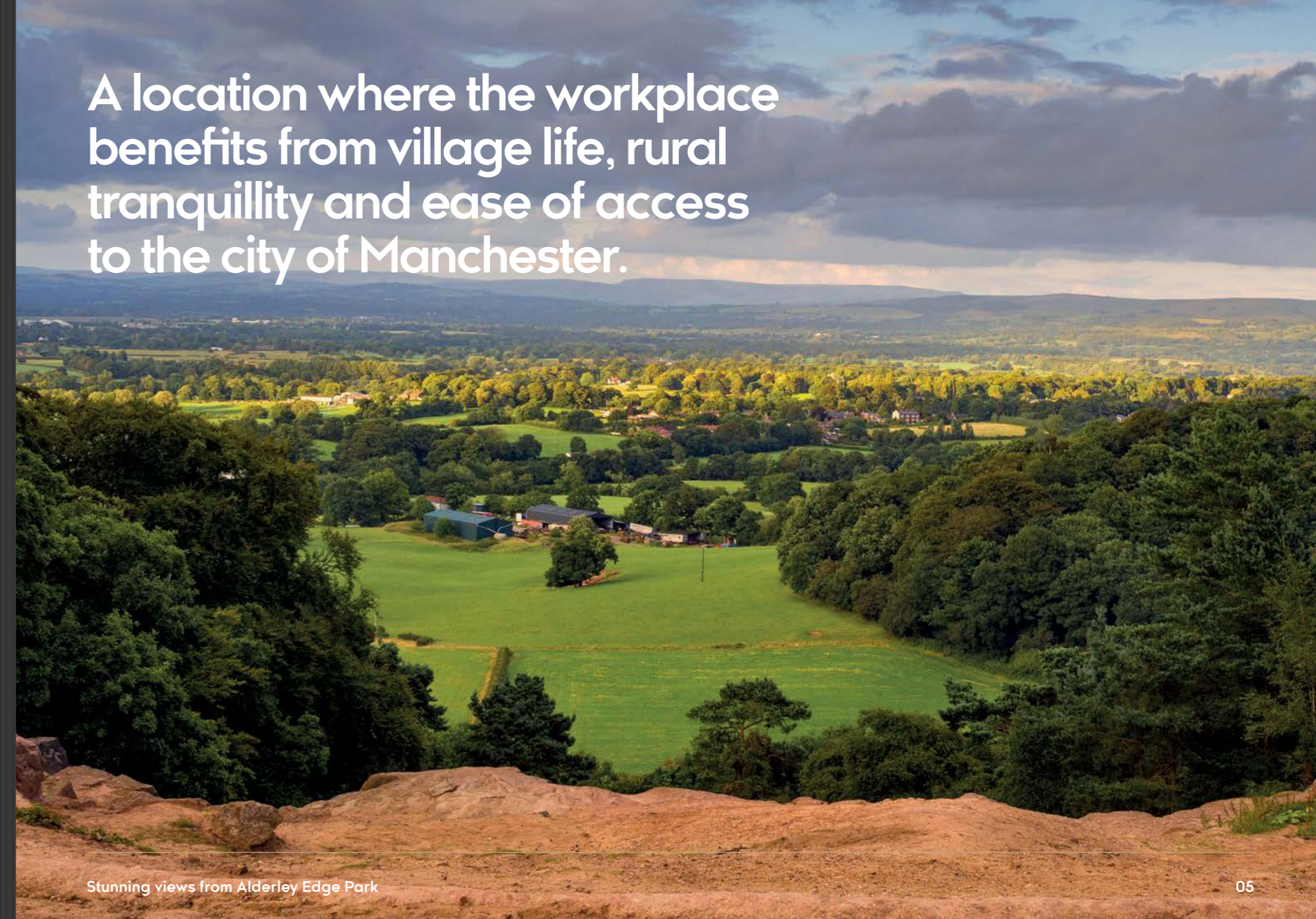
Stunning views from Alderley Edge Park

A location where the workplace benefits from village life, rural tranquillity and ease of access to the city of Manchester.