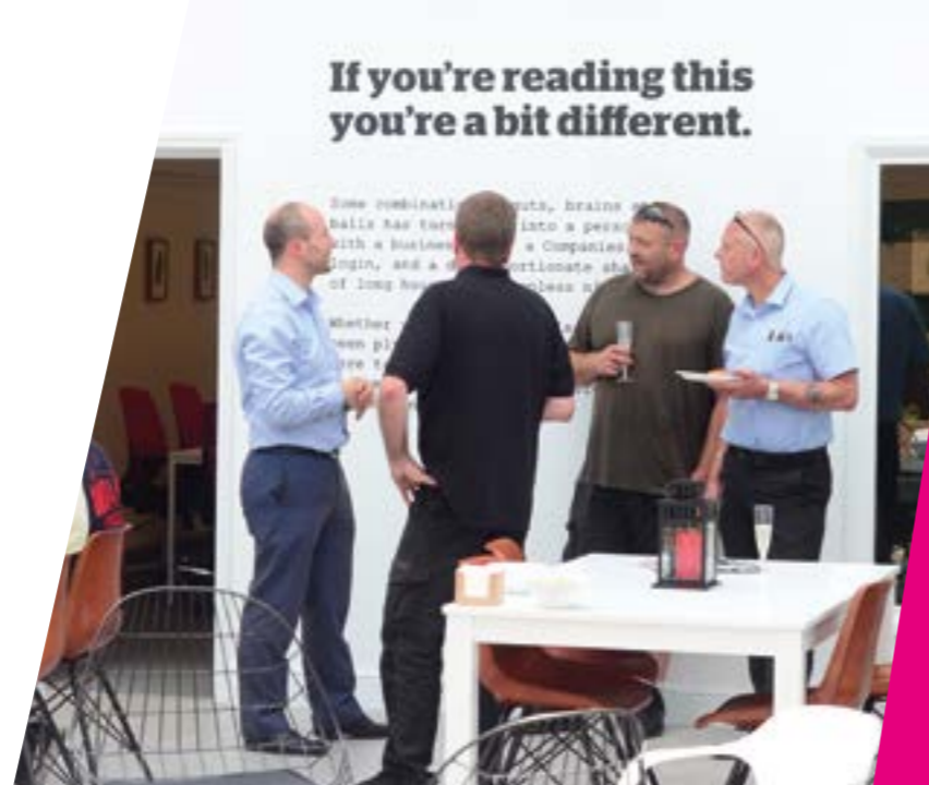
Lombard Business Park, Wimbledon

Free, interactive workshops covering topics such as branding, marketing, SEO, PR and more.