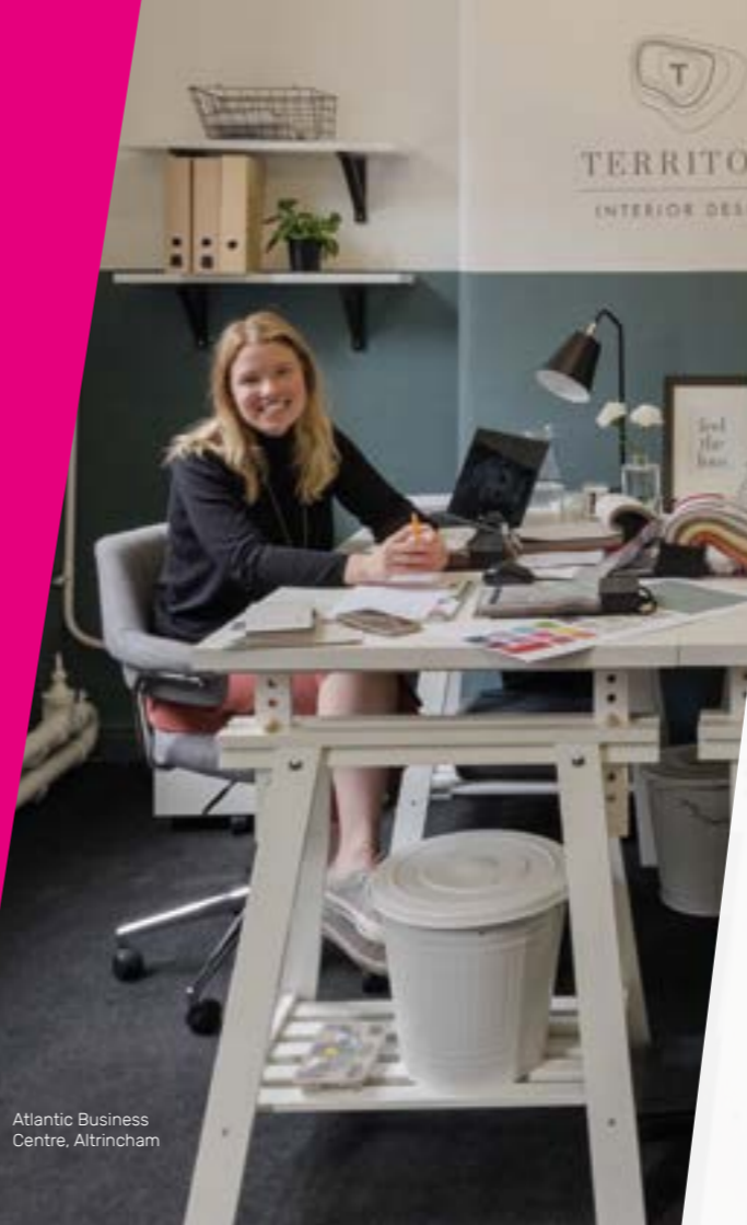
Atlantic Business Centre, Altrincham