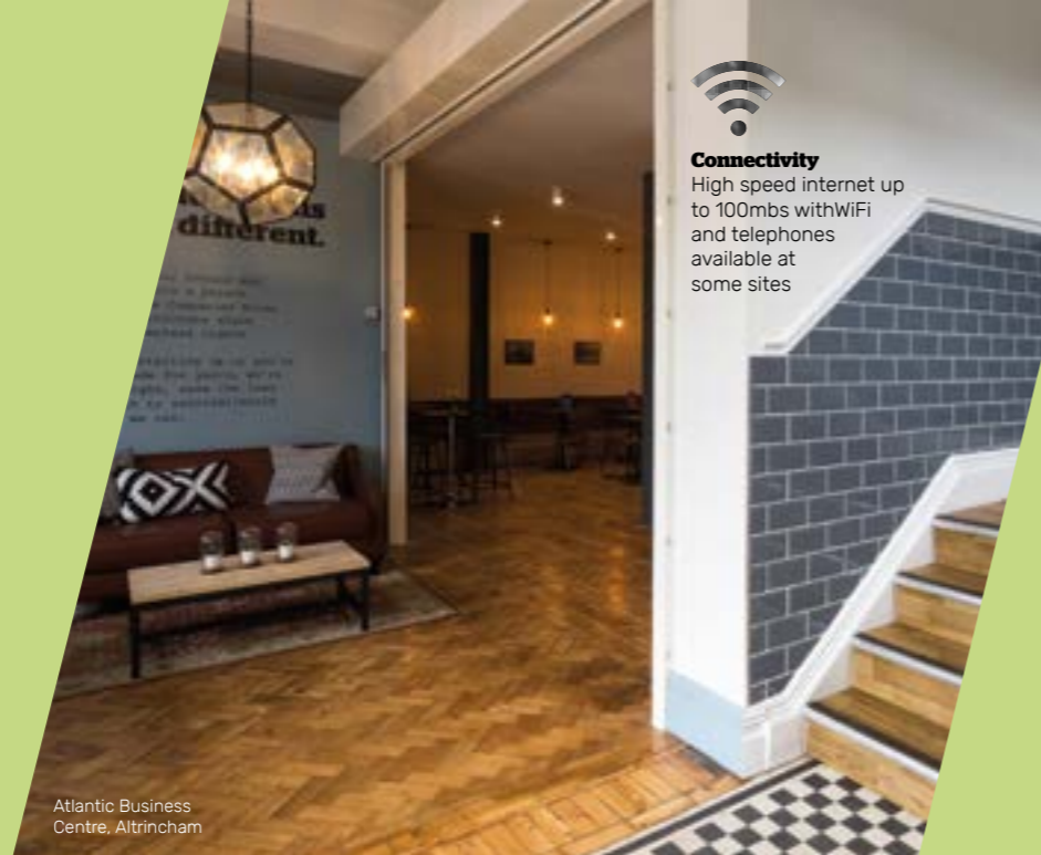
Atlantic Business Centre, Altrincham

Absolutely. Long-term leases don't always suit small businesses. We've created flexible, off-the-peg licences, so you can rent for a year, a month, a week, or even a single day.